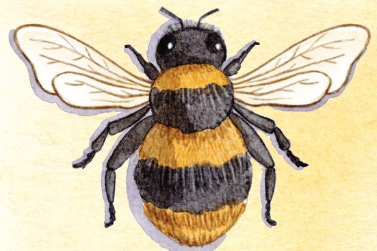
Bumblebee Bombus dahlbomii