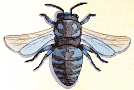
Cuckoo Bee Thyreus nitidulus