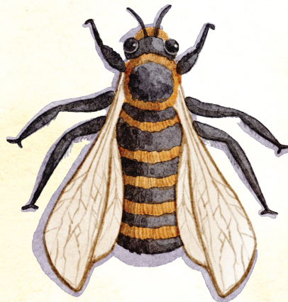
Leafcutter Bee Megachile leachella