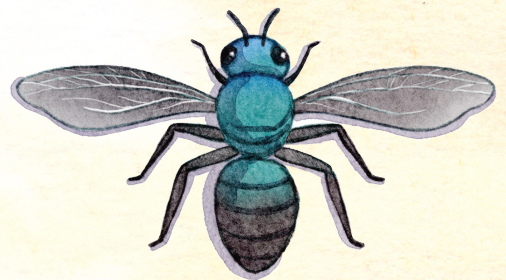
Sweat Bee Augochlora pura