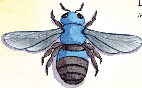
Carpenter Bee Xylocopa violacea