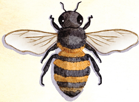
Honey Bee Apis mellifera