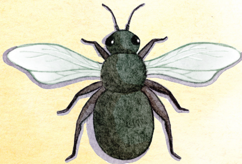
Mason Bee Osmia lignaria