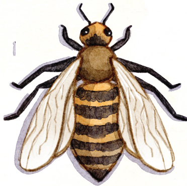
Africanized Bee Apis mellifera scutellata lepeletier