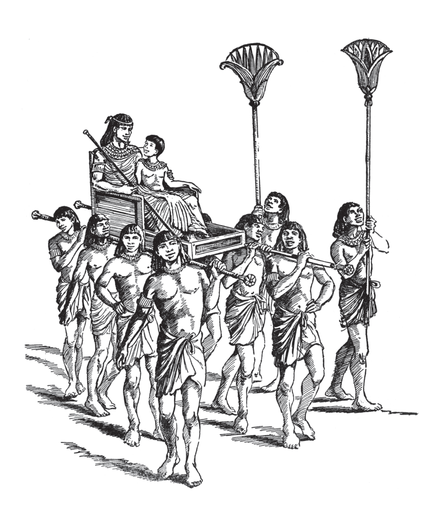
First published in 1952