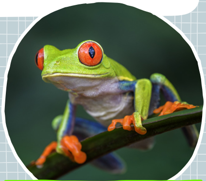
Red-Eyed Tree Frog