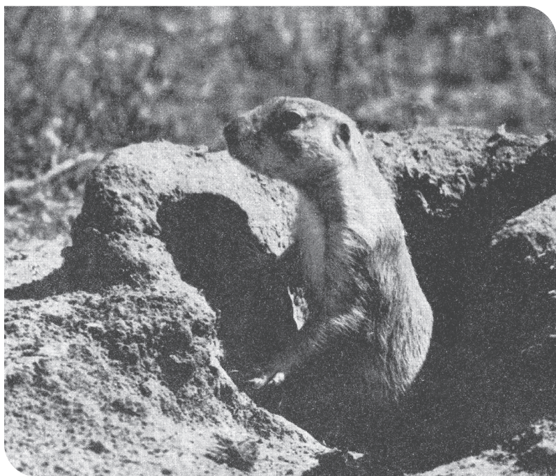
YOUNG MR. PRAIRIE DOG

This yapping sound, like the bark of a toy poodle, was what the early explorers of America heard as they passed the prairie dog towns on their long journeys over the plains, and so they gave these small earth-dwelling animals the name “prairie dogs.” A better name would have been “barking ground squirrel,” for that is what they really are.